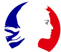
Embassy of France/ Ambassade du France